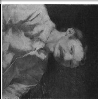
Robert Louis Stevenson 1850-1894 He wrote one of the most popular children's books, Treasure Island.