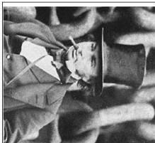
Isambard Kingdom Brunel 1805-1859 A famous engineer who designed bridges, tunnels and steam ships.