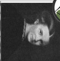
Elizabeth Garrett Anderson 1836-1917 She was the first woman to become a doctor.