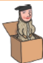
Jack in the box