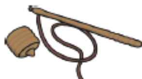
whip and top