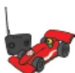
radio controlled vehicles