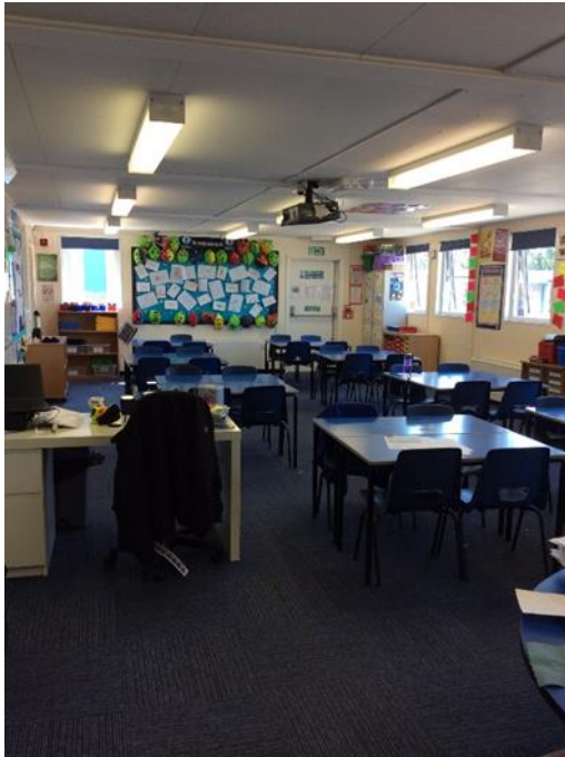
This is 6W's classroom

Our classrooms are in the mobiles opposite Year 5